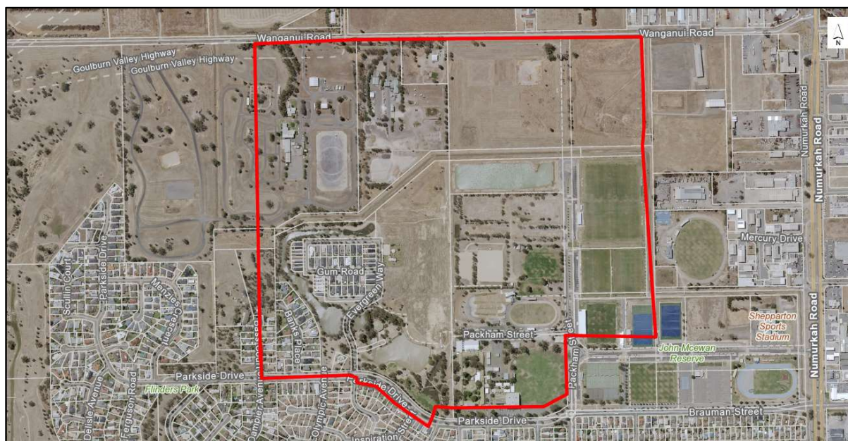
Figure 2: Map of those notified

Submissions were invited via an online submission form, by email and by post.